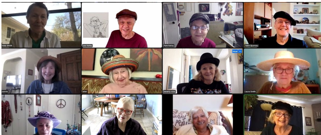
March 23 Poetry Group Dressed for Easter