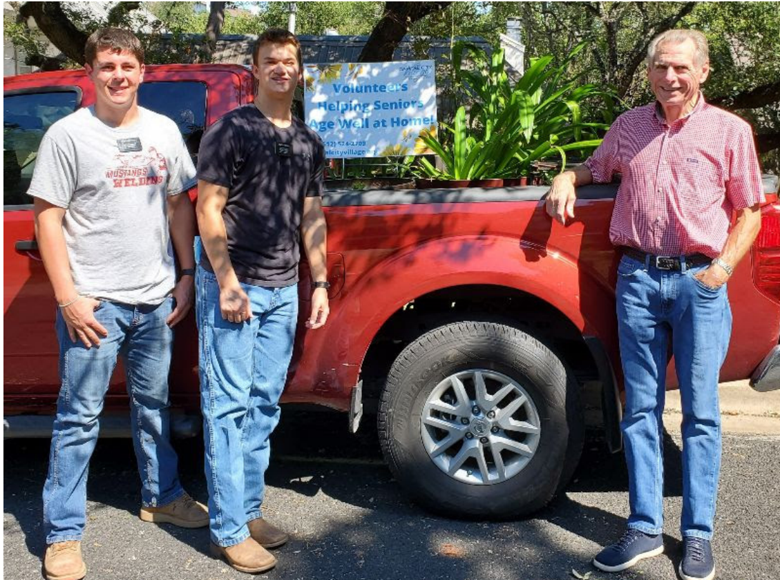
Volunteers from The Church of Jesus Christ of Latter-day Saints and CCV Volunteer Carl at Jimmie's House